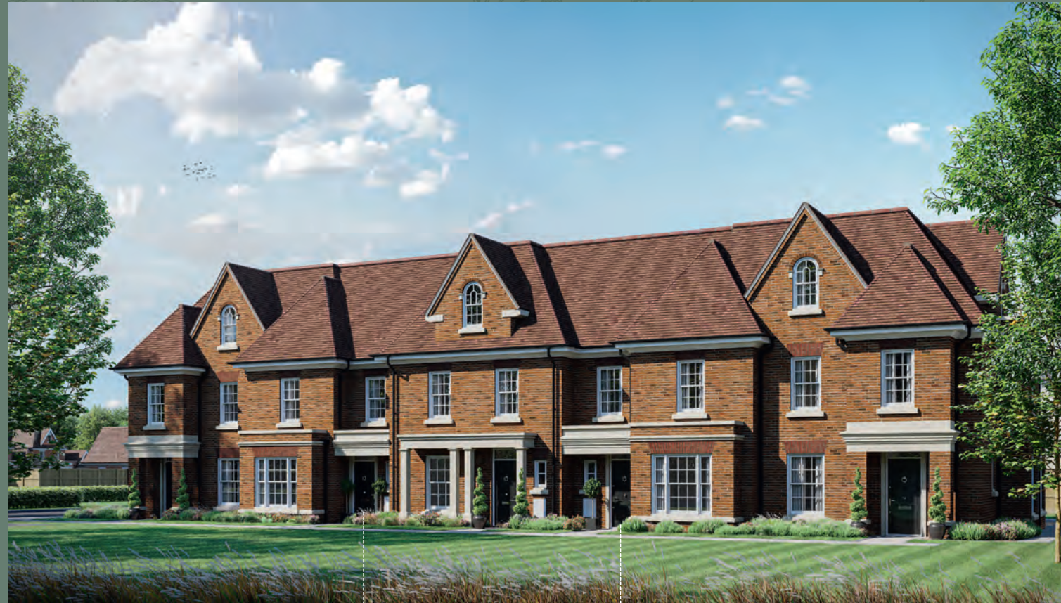
Computer Generated Image – Plots 16 - 20

KITCHEN / DINING | LIVING ROOM RECEPTION ROOM | 3 BEDROOMS SOUTH FACING GARDEN PRIVATE PARKING WITH EV POINT | FREEHOLD