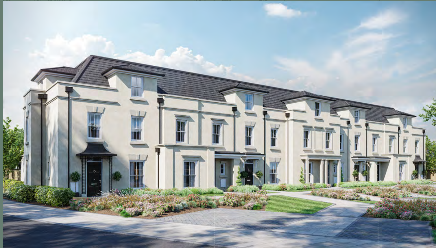
Computer Generated Image – Plots 23 - 29

KITCHEN / DINING | LIVING ROOM RECEPTION ROOM | 3 BEDROOMS | SOUTH FACING GARDEN | PRIVATE PARKING WITH EV POINT | FREEHOLD